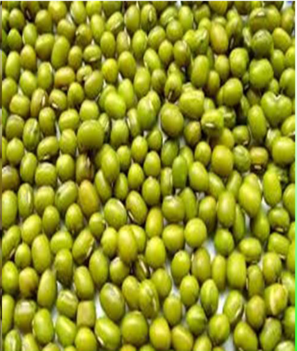
Sprouted Moong Beans